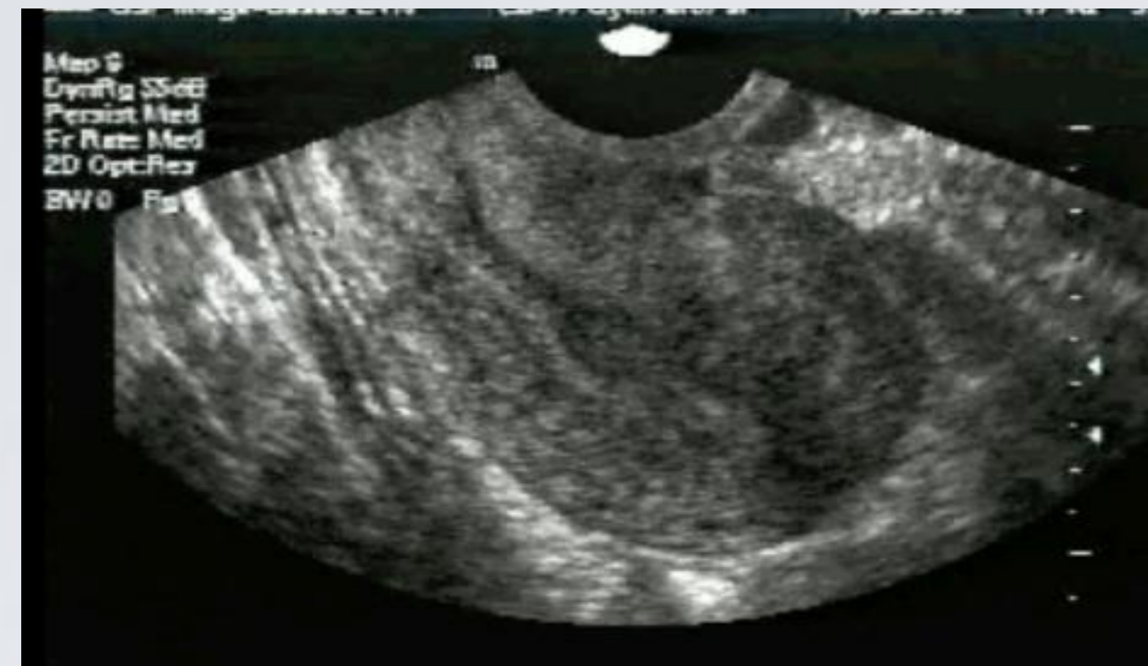
Baseline 24 year old woman at day 14 of her ovulatory cycle

Bacterial infections are increasingly recognized as a cause of human stillbirth and severe or fatal perinatal infections. They may arise from bloodborne infections (hematogenous), ascending infections, vaginal infections, iatrogenic infections, or zoonosis.